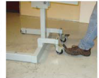
Toe activated wheel safety brake to secure cart in desired position