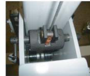
Automatically activated safety brake to prevent load drop in event of cable breakage