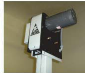
Heavy-Duty transmission standard on all powered MH-800 and MH-1500 models