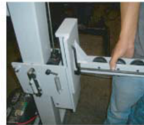
E-Z Change attachments are easily installed and removed