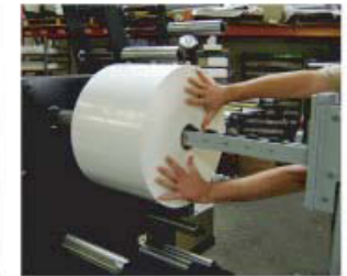
Easily load and remove rolls utilizing roller core attachment