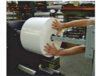
Easily load and remove rolls utilizing roller core attachment