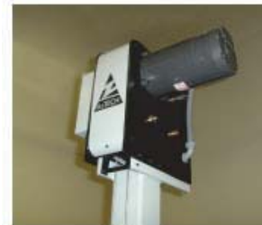
Heavy-Duty transmission standard on all powered MH-800 and MH-1500 models