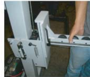
E-Z Change attachments are easily installed and removed