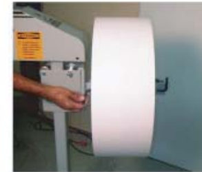
Manually activated roll stop to prevent roll from falling off attachment