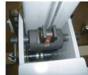
Automatically activated safety brake to prevent load drop in event of cable breakage