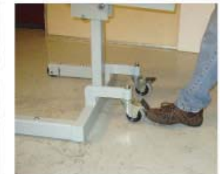
Toe activated wheel safety brake to secure cart in desired position